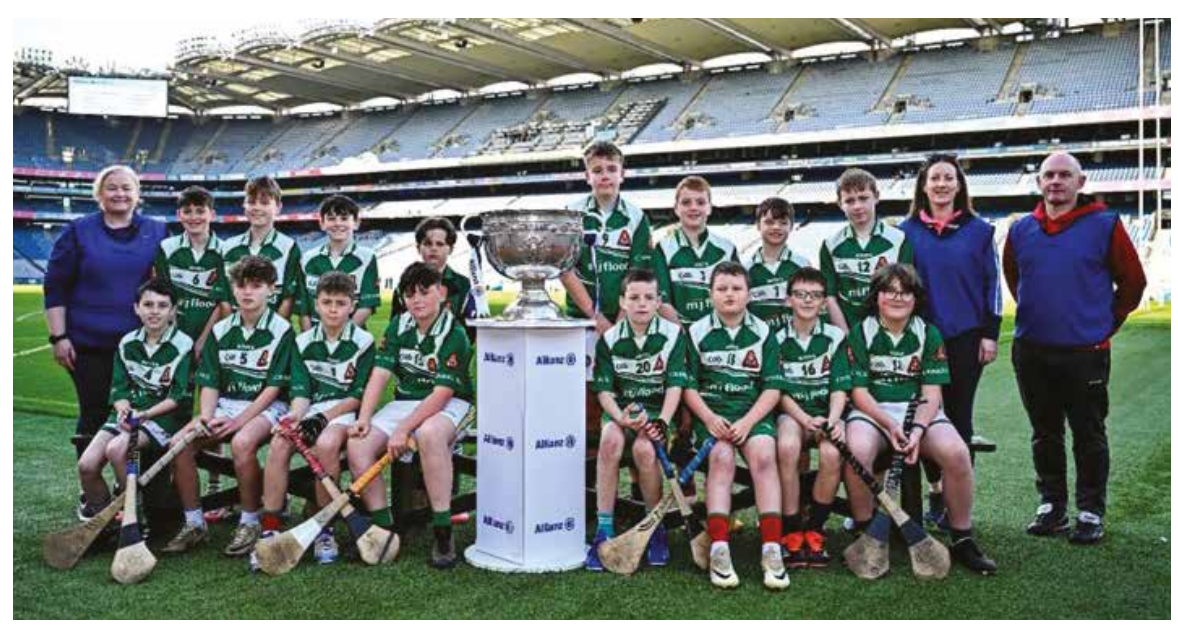
Crinkill N.S. from Offaly, who also won the 2024 Cornmarket Large School of the Award, took part in the Allianz Rewards Pitch Day in Croke Park on the 22nd October 2024.

It is hoped the later date will provide a better opportunity for schools to train, prepare and increase the profile of county, provincial, and national handball