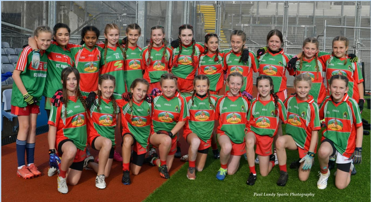
Paul Lundy Sports Photography