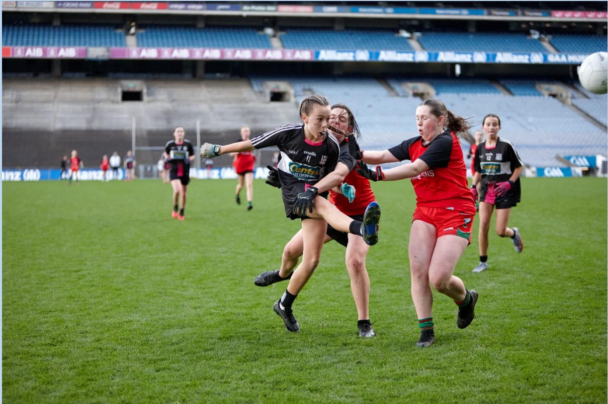
Paul Lundy Sports Photography