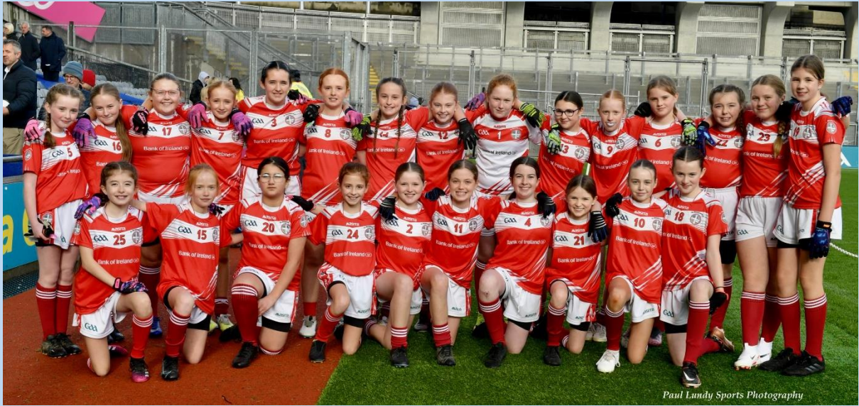
Paul Lundy Sports Photography