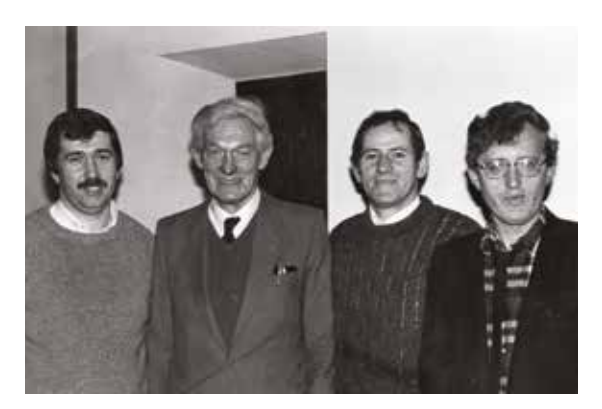
Sciath na Scol group

that the movement was established as a national body, rather than a disparate group of committees. The name given to the body founded in 1971 was An Bord Eadar Chathrach. Five counties, Cork, Dublin, Galway, Limerick and Waterford were represented at a meeting in Dublin on the weekend of the All-Ireland football final in that