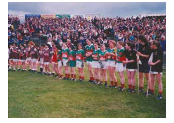
learn lessons for life as part of a team. Teachers, too, have derived great satisfaction and enjoyment from their involvement in Cumann na mBunscol. Our lives have been enriched by the hours spent encouraging and enabling children to play Gaelic Games and by the friendships we have made along the way. Many of the people involved since 1971 are imithe ar slí na fírinne but their work lives on.

An Bord Eadar Cheatharach was known as Bord Luthchleas Gael na mBunscoileanna from 1977 until a motion to change its name to Cumann na mBunscol was formally adopted at the AGM in 1991. It is impossible to estimate the number of children who have participated in Gaelic Games in our primary schools in the course of the past half-century. For many, it was the first step on the road to fame and glory. For others, it may have been the only time they enjoyed the benefits of organised sport. For all, boys and girls, Cumann na mBunscol in its various iterations has afforded children a chance to play with their schoolmates, to enjoy playing our native games and to